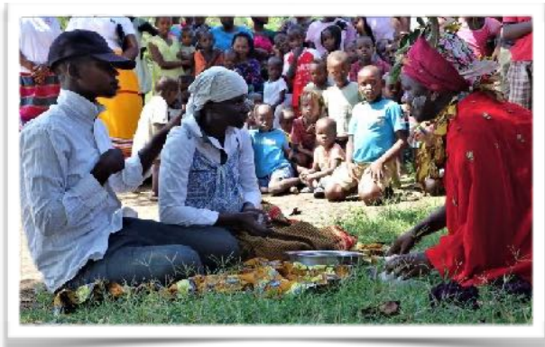
Community stage play debunking misconceptions about bilharzia.

schistosomiasis. They later on used the data party approach to disseminate key findings of KAPs lived experiences and the world café technique to co-design a contextualized communication strategy .