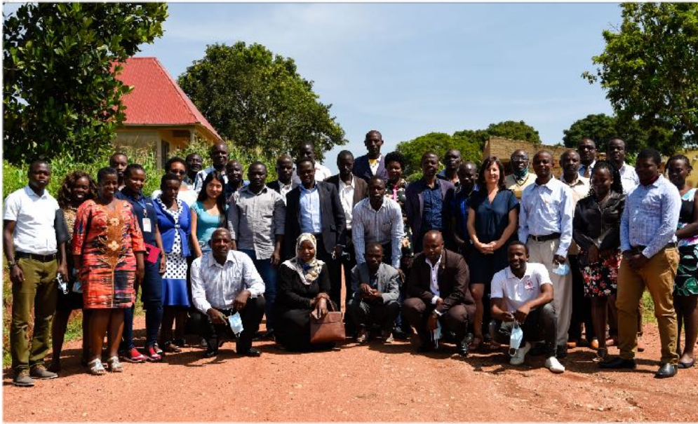
Final day of the awareness week, November 2021, Kagadi District.

Action Towards Reducing Aquatic snail-borne Parasitic diseases