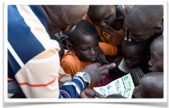
An informed community, is a healthier community!

associated with schistosomiasis were identified including: lack of access to clean and safe water, low latrine coverage leading to open defecation, poor health-seeking behaviours, inadequate drug supply, inadequate knowledge about the disease, myths and misconceptions, stigma, isolation, and domestic violence.