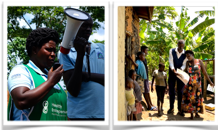
Left: CRs in action raising awareness through megaphones. Right: Door to door visits made by the CRs.

Despite the uncertainties generated by COVID-19, the ATRAP' CRs have made great strides. They received a refresher training in January where personalized feedback was provided to each participant. This is reflected in the great progress made in the data reported on snail presence, water parameters, and human-related activities. They also took the lead in the planning and execution of the snail-borne awareness week activities with support from the entire ATRAP team.