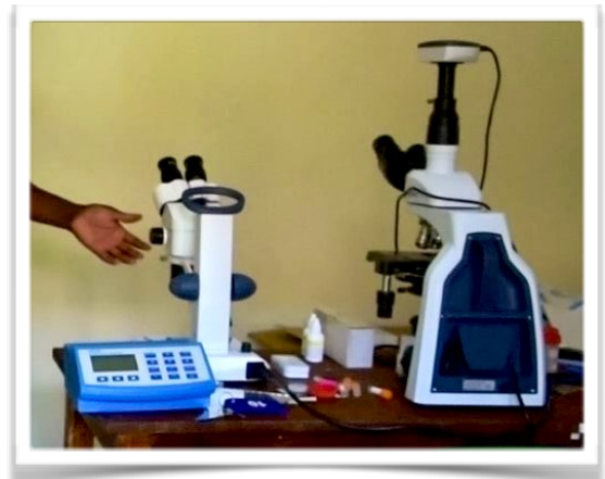
Mobile biology field lab used to analyze the type of parasite found in the snails.

The biology students monitored monthly the snail population and the associated parasites using shedding experiments and PCR techniques. Stool samples of livestock and wild mammals were also examined for parasite eggs. They also interviewed a total of 100 livestock owners, veterinary officers, herders, butchers, and game rangers to probe their knowledge and perceptions about animal bilharzia and liver flukes.