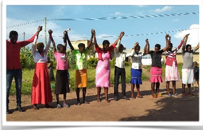
End of the theatre play: enthusiastic community members after spreading a positive message.

regarding schistosomiasis preventive measures, enacting by-laws to enforce preventive measures, district and sub-county to include water, sanitation, and hygiene in their planning and budgeting, involvement of cultural and religious leaders to debunk cultural beliefs, and the involvement of citizen researchers, VHTs and other members of the communities in preventive measures.