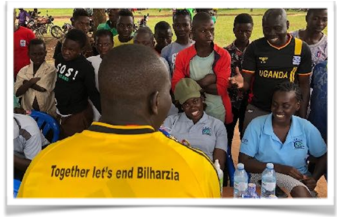
Powerful message spread by the players during the football tournament.

bilharzia infection using diagnostic PCR tests. About 11.5% of the Bulinus snails from Mpeefu (upland) were infected with animal bilharzia ( S. bovis ). Human bilharzia was only detected at the lake sites while bilharzia of rodents ( S. rodhaini ) was detected at various upland sites (prevalence < 05%).